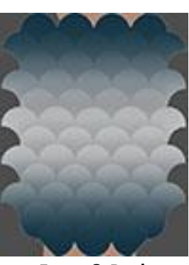
Front & Back